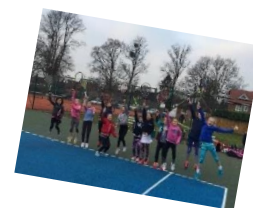
Fun at BTC

To: Parents of Year 1, Year 2, Year 3, Year 4, Pupils at Stoke Poges School SUMMER Term 2024