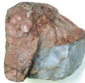
obsidian granite basalt