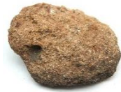
limestone chalk sandstone

These rocks form under the sea. Rocks are broken into small pieces by wind/water ( erosion ). They settle as mud, sand, minerals and even remains of living things. Over time, layers pile up and the pressure turns this sediment into rock.