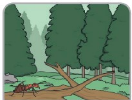
inside rotting wood